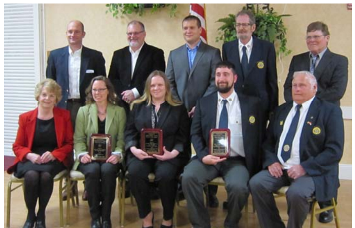
2015 Community Improvement Awards Presented March 23, 2016