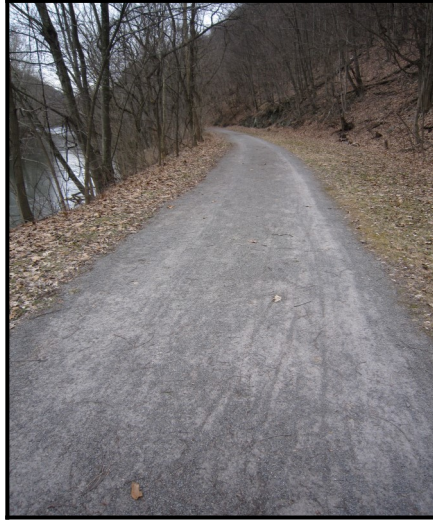
Lower Trail Surface Rehabilitation, Morris Township, March 2016

These funds are intended for “the planning, acquisition, development, rehabilitation and repair of greenways, recreational trails, open space, natural areas, community conservation and beautification projects, community and heritage parks and water resource management. Funds may be used to acquire lands for recreational or conservation purposes and land damaged or prone to drainage by storms or flooding.”