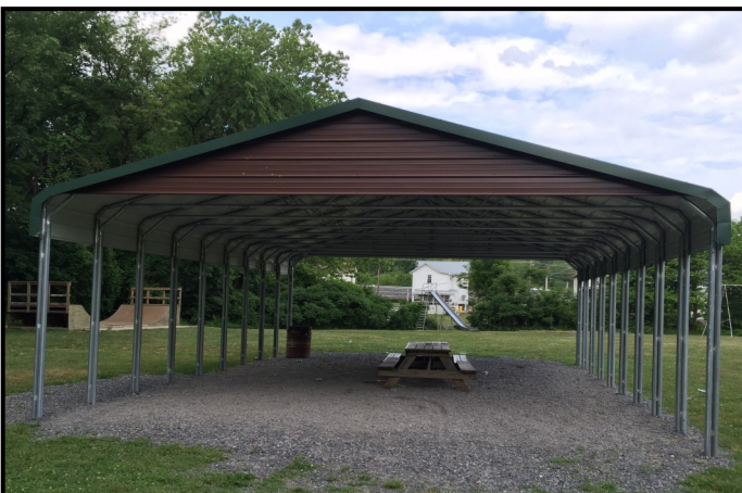
Lower Municipal Park Pavilion, Mount Union Borough, May 2015

In May 2019, four applications totaling $31,590.84 were received and reviewed by the County Planning Commission. Recommendations were forwarded to